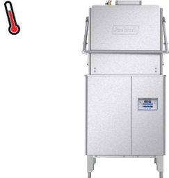
DYNASTAR® VER electric only