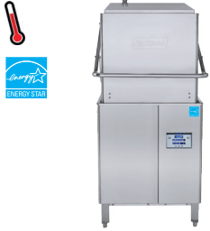
DYNASTAR® electric only

Coffee Shops • Quick Service Restaurants • <100-Seat Full Service Restaurants <125-Bed Health Care Facilities • Elementary Schools • Small Middle & High Schools