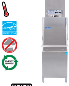
TEMPSTAR® HH-E VER electric only