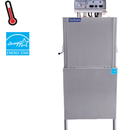
TEMPSTAR® electric only