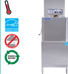
TEMPSTAR® VER electric only