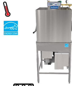
NXP-HTD electric only