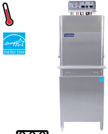
TEMPSTAR® HH-E electric only